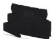
End cover for TERMITRAB TT-ST-..., width: 2.2 mm, color: Black