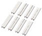
Zack marker strip, Can be ordered: Strip, white, Labeled according to customer specifications, Mounting type: Snap into tall marker groove, For terminal block width: 5.2 mm, Lettering field: 5.15 x 10.5 mm

Marker for terminal blocks - UC-TM 5 CUS - 0824581