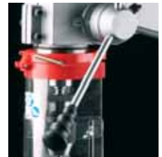
Capstan arm with ergonomic rubber handles