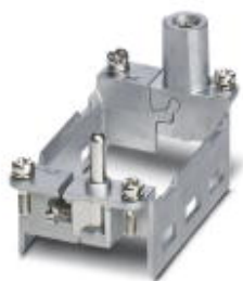
HEAVYCON hinged retaining frame, for HC-B 10 sleeve housing, for 3 modules, labeling with upper case letters (A, B, C, etc.)

Please be informed that the data shown in this PDF Document is generated from our Online Catalog. Please find the complete data in the user's documentation. Our General Terms of Use for Downloads are valid ( http://download.phoenixcontact.com )