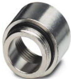
The illustration shows version HC-NPT-1/2-M20

NPT adapter, IP68, up to 5 bar, incl. O-ring seal, M32 to 1"