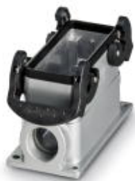
Box mounting base, with double locking latch, height 67 mm, without screw connection, 2x Pg21

Please be informed that the data shown in this PDF Document is generated from our Online Catalog. Please find the complete data in the user's documentation. Our General Terms of Use for Downloads are valid ( http://phoenixcontact.com/download )