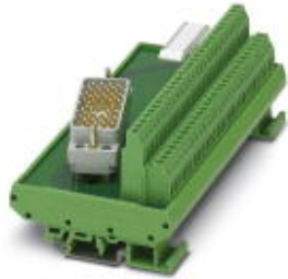
VARIOFACE module, for ELCO connector, for mounting on NS 35/7.5 or NS 32, with pin strip 8016 right, no. of positions 56

Please be informed that the data shown in this PDF Document is generated from our Online Catalog. Please find the complete data in the user's documentation. Our General Terms of Use for Downloads are valid ( http://phoenixcontact.com/download )