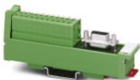
The illustration shows the version UM 25-D 9SUB/B/FRONT/Q

VARIOFACE SLIM LINE, with screw connection and D-subminiature pin strip, for assembly at a right angle on NS 35/7.5, 9 positions