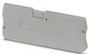
The figure shows a version of the article

End cover, Length: 78.5 mm, Width: 2.2 mm, Color: gray