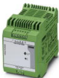
Primary-switched MINI POWER power supply for DIN rail mounting, input: 1-phase, output: 24 V DC/100 W

Please be informed that the data shown in this PDF Document is generated from our Online Catalog. Please find the complete data in the user's documentation. Our General Terms of Use for Downloads are valid ( http://phoenixcontact.com/download )