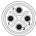
Connector pin assignment of M12 plug, 4-pos., S-coded, view of pin side