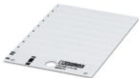
The figure shows a version of the article

Snap-in markers, Card, white, unlabeled, can be labeled with: THERMOMARK CARD, Mounting type: snapped into marker carrier, Lettering field: 70 x 15 mm