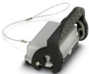
HEAVYCON protective cover, type B10, for sleeve housing without single locking latch, with retaining cord, IP54

Please be informed that the data shown in this PDF Document is generated from our Online Catalog. Please find the complete data in the user's documentation. Our General Terms of Use for Downloads are valid ( http://phoenixcontact.com/download )