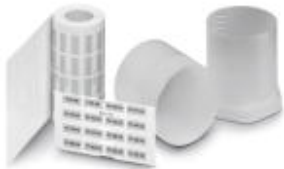
The figure shows the EML (15X9)R SR product variant

Label, Roll, silver/matt, unlabeled, can be labeled with: THERMOMARK ROLL, THERMOMARK ROLL X1, THERMOMARK X, THERMOMARK S1.1, Mounting type: Adhesive, Lettering field: 21.5 x 21.5 mm