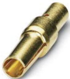
Crimp contact, turned, Single contact, contact diameter: 1 mm, crimp range: 0.14 mm 2 ... 0.56 mm 2

Please be informed that the data shown in this PDF Document is generated from our Online Catalog. Please find the complete data in the user's documentation. Our General Terms of Use for Downloads are valid ( http://phoenixcontact.com/download )