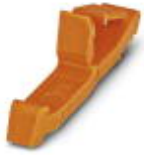
Latching, Color: orange