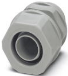
Cable gland made from PP with Pg thread, IP65 protection

Please be informed that the data shown in this PDF Document is generated from our Online Catalog. Please find the complete data in the user's documentation. Our General Terms of Use for Downloads are valid ( http://phoenixcontact.com/download )