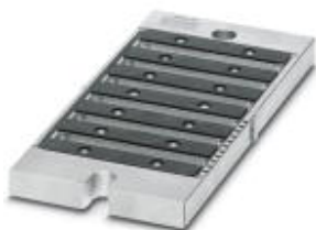
Magazine for the THERMOMARK CARD printer, for accommodating UCT sheets UCT-EM (17 x 9) and UCT-EM (17.5 x 9)

Please be informed that the data shown in this PDF Document is generated from our Online Catalog. Please find the complete data in the user's documentation. Our General Terms of Use for Downloads are valid ( http://phoenixcontact.com/download )