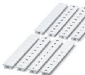
Zack marker strip, 10-section, horizontally labeled with the consecutive numbers: 1 ... 10, white, Width: 7.5 mm

Please be informed that the data shown in this PDF Document is generated from our Online Catalog. Please find the complete data in the user's documentation. Our General Terms of Use for Downloads are valid ( http://download.phoenixcontact.com )