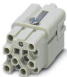
HEAVYCON socket insert, Q12 series, 12-pos., crimp connection, with coding option

Please be informed that the data shown in this PDF Document is generated from our Online Catalog. Please find the complete data in the user's documentation. Our General Terms of Use for Downloads are valid ( http://phoenixcontact.com/download )