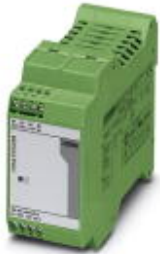
Primary-switched MINI POWER power supply for DIN rail mounting, input: 1-phase, output: 2x 15 V DC/1 A

Please be informed that the data shown in this PDF Document is generated from our Online Catalog. Please find the complete data in the user's documentation. Our General Terms of Use for Downloads are valid ( http://phoenixcontact.com/download )