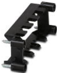
The illustration shows the version VC-TR 1/2 M

Sleeve frame, without PE, for contact insert modules, type 2, number of insert modules 3