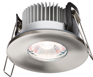
Shown with Bezel (not included)