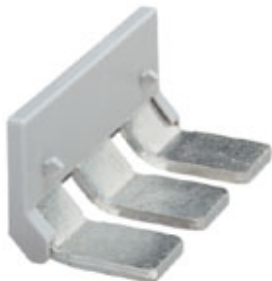
Insertion bridge, Number of positions: 3, Color: gray

Please be informed that the data shown in this PDF Document is generated from our Online Catalog. Please find the complete data in the user's documentation. Our General Terms of Use for Downloads are valid ( http://phoenixcontact.com/download )