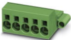
The illustration shows the 5-pos. version

Plug component, Nominal current: 76 A, Rated voltage (III/2): 1000 V, Number of positions: 2, Pitch: 10.16 mm, Connection method: Spring-cage connection, Color: green, Contact surface: Silver