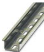
DIN rail, material: steel galvanized and passivated with a thick layer, perforated, height 15 mm, width 35 mm, length: 2000 mm

DIN rail perforated - NS 35/15 PERF 2000MM - 1201730