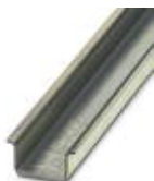
DIN rail, material: Steel, unperforated, height 15 mm, width 35 mm, length: 2 m

DIN rail, unperforated - NS 35/15 UNPERF 2000MM - 1201714