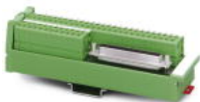
The illustration shows the version UM 25-D 9SUB/B/FRONT/Q

VARIOFACE SLIM LINE, with screw connection and D-subminiature pin strip, for assembly at a right angle on NS 35/7.5, 37 positions