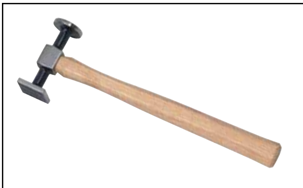
3720 - Cross Faced Shrinking Hammer