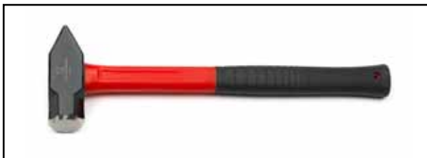
82291 - 40 oz. Blacksmiths Hammer