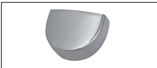
3723 - Heel Dolly