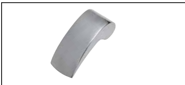
3725 - Wedge Dolly