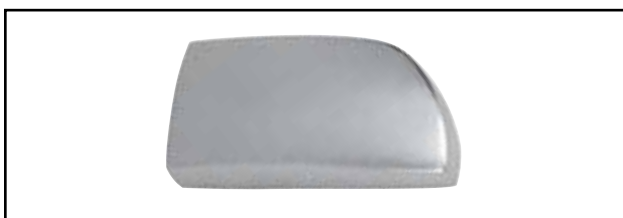
3722 - Toe Dolly