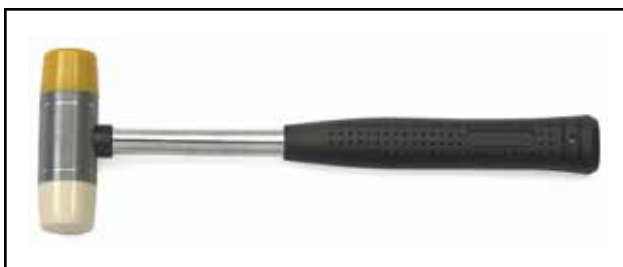
82260 - 12 oz. Soft Face Hammer