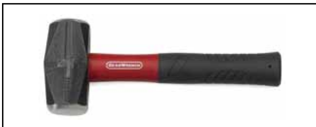
82255 - 3 lb Drilling Hammer