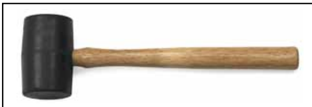
82259 - 16 oz. Rubber Mallet - Wood Hickory Handle