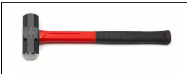
82289 - 3 lb Engineers Hammer