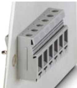
The illustration shows version VDFK 6/K in gray

Please be informed that the data shown in this PDF Document is generated from our Online Catalog. Please find the complete data in the user's documentation. Our General Terms of Use for Downloads are valid ( http://phoenixcontact.com/download )