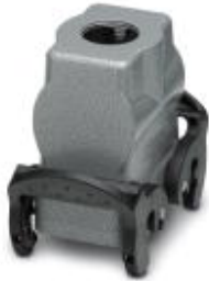
HEAVYCON sleeve housing B10, with double locking latch, height 72 mm, with thread 1x M25, straight conductor exit

Please be informed that the data shown in this PDF Document is generated from our Online Catalog. Please find the complete data in the user's documentation. Our General Terms of Use for Downloads are valid ( http://phoenixcontact.com/download )