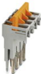
Switching jumper, Length: 24.7 mm, Width: 32.8 mm, Number of positions: 4, Color: gray/orange

Please be informed that the data shown in this PDF Document is generated from our Online Catalog. Please find the complete data in the user's documentation. Our General Terms of Use for Downloads are valid ( http://phoenixcontact.com/download )