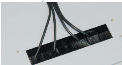
brush strip cable entry