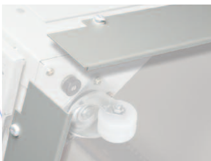
base showing plinth kit mounted