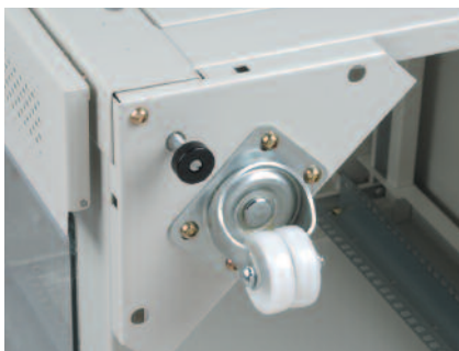
base showing castor and jacking foot