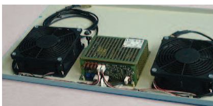
underside view of fan tray showing controller