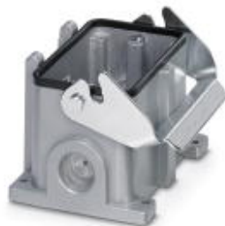
Box mounting base, with single locking latch, height 100 mm, with screw connection, 1x Pg29

Please be informed that the data shown in this PDF Document is generated from our Online Catalog. Please find the complete data in the user's documentation. Our General Terms of Use for Downloads are valid ( http://phoenixcontact.com/download )