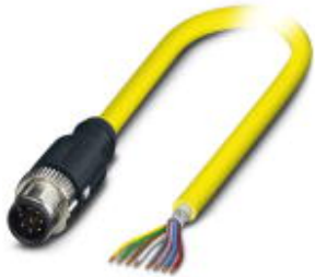
Sensor/Actuator cable, 8-position, PVC, yellow, shielded, Plug straight M12 SPEEDCON, A-coded, on Free cable end, Cable length: 5 m

Please be informed that the data shown in this PDF Document is generated from our Online Catalog. Please find the complete data in the user's documentation. Our General Terms of Use for Downloads are valid ( http://download.phoenixcontact.com )