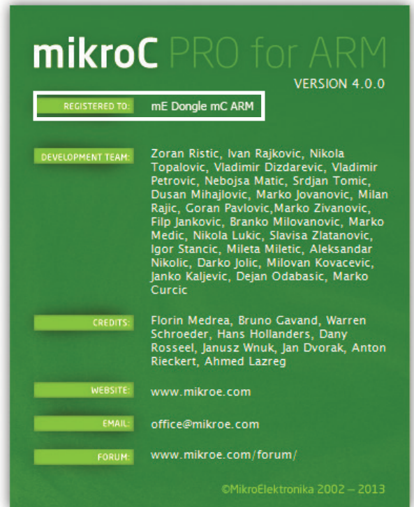
Figure 1-2: mikroC PRO for ARM® About Window