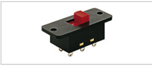
Similar to original product