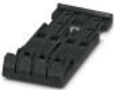
Strain relief, Number of positions: 4, Color: black