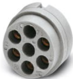
The figure shows the 6-pos. product version

Contact insert, Number of positions: 12, Type of contact: Male connector, Crimp connection