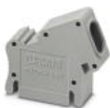
Cable housing, Width: 10.4 mm, Number of positions: 2, Color: gray