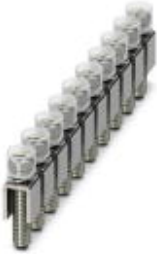
Fixed bridge, Number of positions: 10, Color: silver

Please be informed that the data shown in this PDF Document is generated from our Online Catalog. Please find the complete data in the user's documentation. Our General Terms of Use for Downloads are valid ( http://phoenixcontact.com/download )