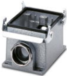
Box mounting base, with double locking latch, height 72 mm, with screw connection, 2x Pg29

Please be informed that the data shown in this PDF Document is generated from our Online Catalog. Please find the complete data in the user's documentation. Our General Terms of Use for Downloads are valid ( http://phoenixcontact.com/download )