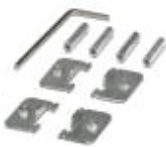
HMI mounting kit for installation on a front plate. The mounting kit includes 6 x mounting brackets, 6 x screw threads, and a hexagonal wrench.

Mounting kit - HMI SCB MOUNTING KIT 6 - 2701385