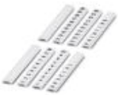
Zack Marker strip, flat, Strip, white, labeled, Printed horizontally: Consecutive numbers 1 - 10, 11 - 20, etc. up to 491 - 500, Mounting type: Snap into flat marker groove, for terminal block width: 5 mm, Lettering field: 5.15 x 5.15 mm

Zack Marker strip, flat - ZBF 5,LGS:FORTL.ZAHLEN - 0808671