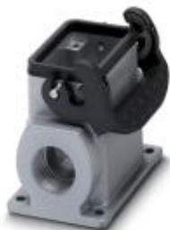
Box mounting base, with single locking latch, height 52 mm, without screw connection, 2x Pg16

Please be informed that the data shown in this PDF Document is generated from our Online Catalog. Please find the complete data in the user's documentation. Our General Terms of Use for Downloads are valid ( http://phoenixcontact.com/download )