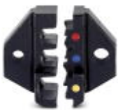
Spare die for CRIMPFOX-RCI 6-1

Replacement die - CRIMPFOX-RCI 6-1/DIE - 1212290