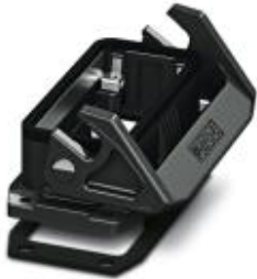
HEAVYCON EVO panel mounting base, plastic, B16, with single locking latch, height: 30.5 mm, with flat gasket

Please be informed that the data shown in this PDF Document is generated from our Online Catalog. Please find the complete data in the user's documentation. Our General Terms of Use for Downloads are valid ( http://phoenixcontact.com/download )