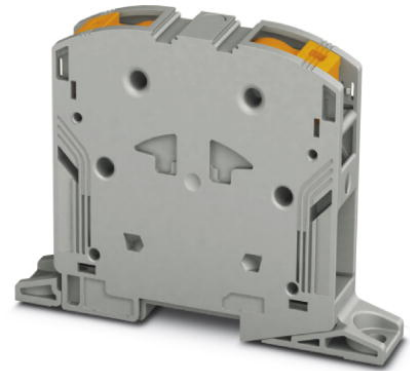
Image shows the version in gray

Feed-through terminal block, Connection method: Push-in connection, Cross section: 25 mm 2 - 95 mm 2 , AWG: 4 - 3/0, Width: 25 mm, Height: 99.8 mm, Color: blue, Mounting type: Direct screw connection