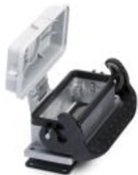
HEAVYCON panel mounting base HV3, with single locking latch, height 27 mm, with cover

Please be informed that the data shown in this PDF Document is generated from our Online Catalog. Please find the complete data in the user's documentation. Our General Terms of Use for Downloads are valid ( http://phoenixcontact.com/download )