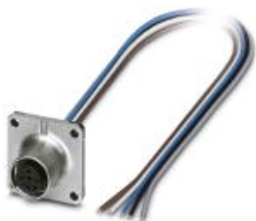
Sensor/Actuator flush-type socket, 5-pos., M12, A-coded, front/square flange mounting, with 0.5 m TPE litz wire, 5 x 0.34 mm 2

Please be informed that the data shown in this PDF Document is generated from our Online Catalog. Please find the complete data in the user's documentation. Our General Terms of Use for Downloads are valid ( http://phoenixcontact.com/download )