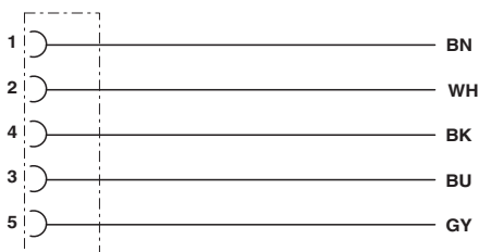
Contact assignment of the M12 plug and the M12 socket