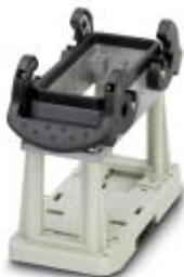
HEAVYCON connector assembly frame with panel mounting base with single locking latch, for contact inserts of type B6

Please be informed that the data shown in this PDF Document is generated from our Online Catalog. Please find the complete data in the user's documentation. Our General Terms of Use for Downloads are valid ( http://phoenixcontact.com/download )